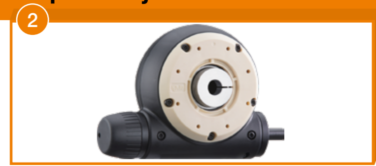
drygear® Apero® gearboxes Inverted worm gear, ratio 4:1