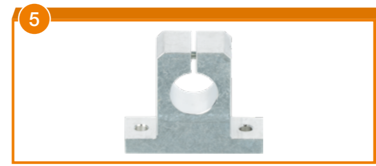
Shaft end block

You can find more information at: igus.eu/apiro-ideas