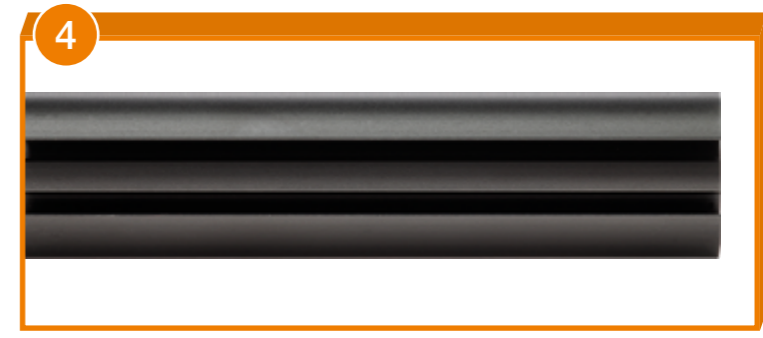
drygear® Apero® universal profile